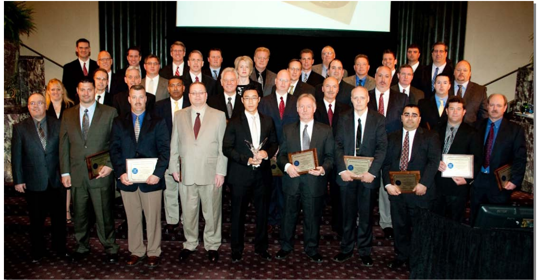
April 18, 2010 ~ CTP Graduation, Cincinnati, OH