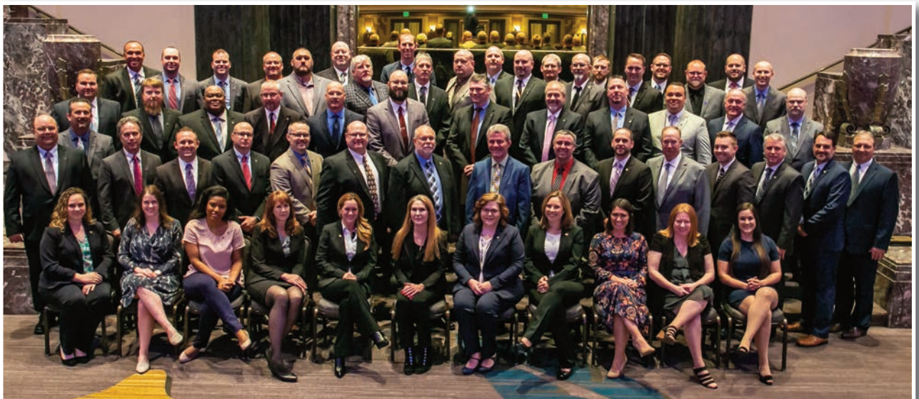
Class of 2018

To learn more about the CTP® program, visit www.nptc.org , or contact Kristen Todd at ktodd@nptc.org or (703) 838-8841.